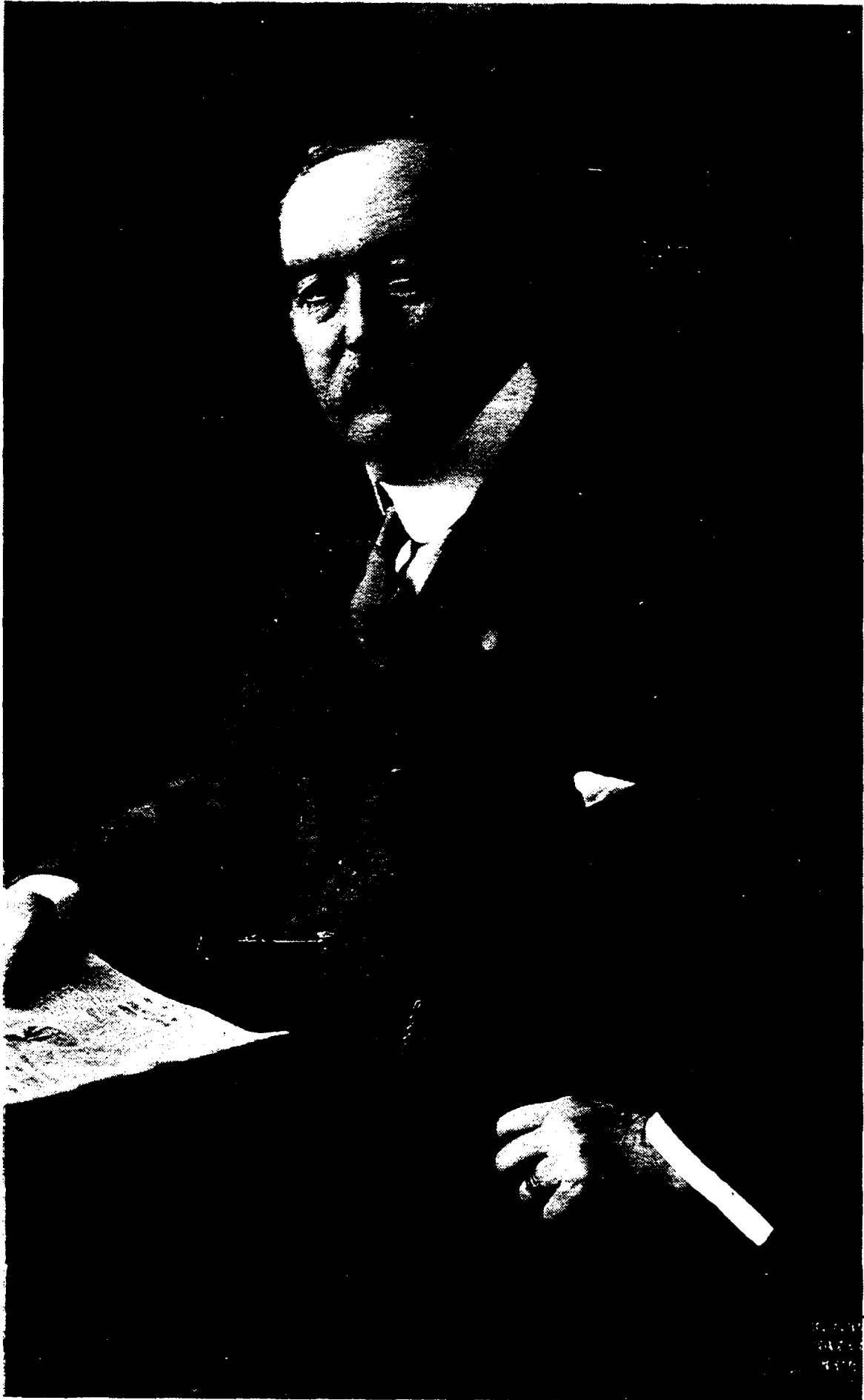
CHARLES DARWIN BINGHAM