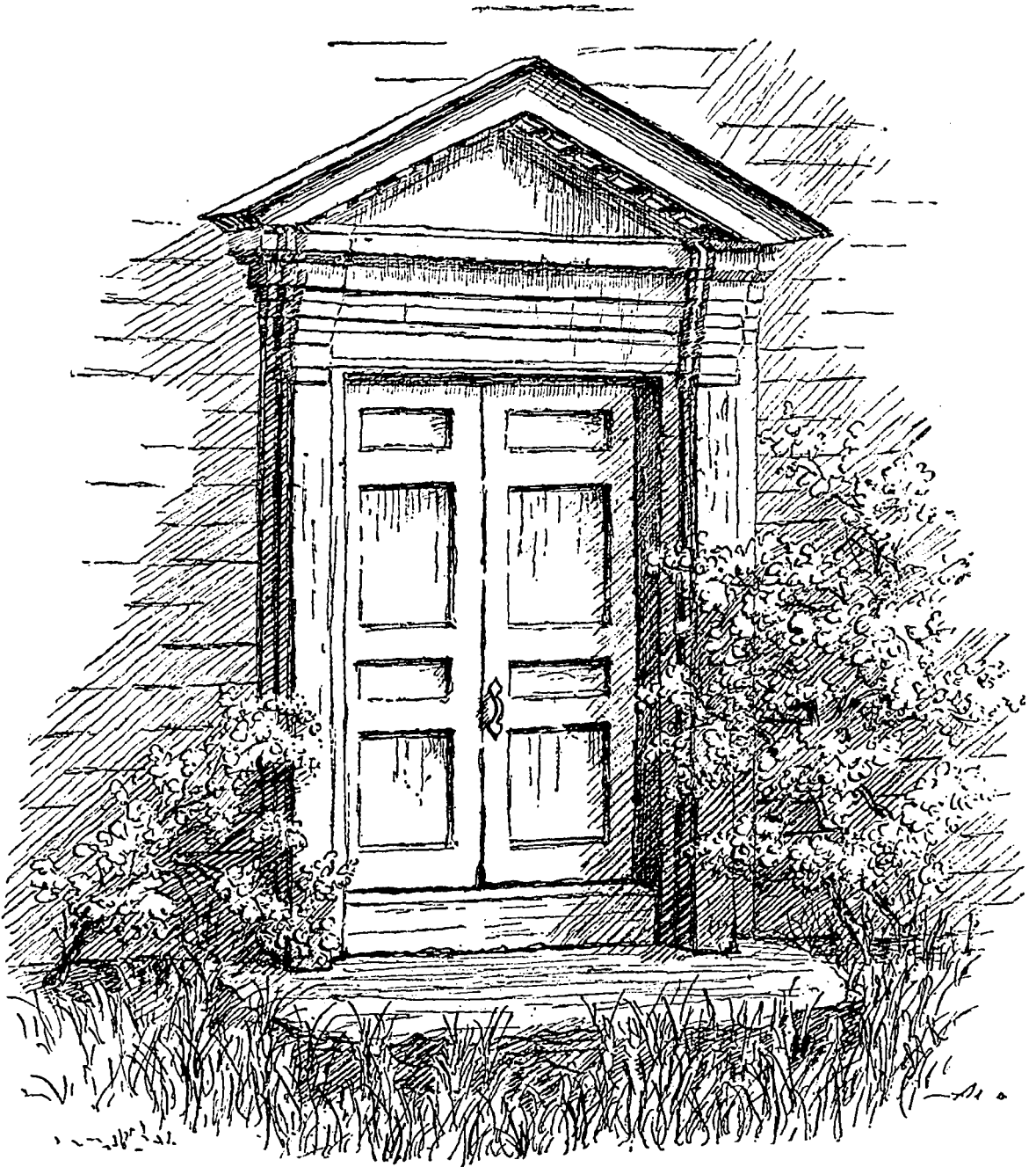
MAIN ENTRANCE OF ROCKINGHAM MEETING HOUSE.