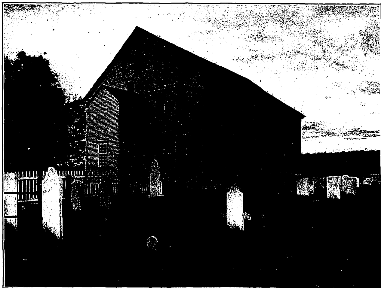
Old Church at Rockingham, Vermont. (Begun 1787.) Exterior.