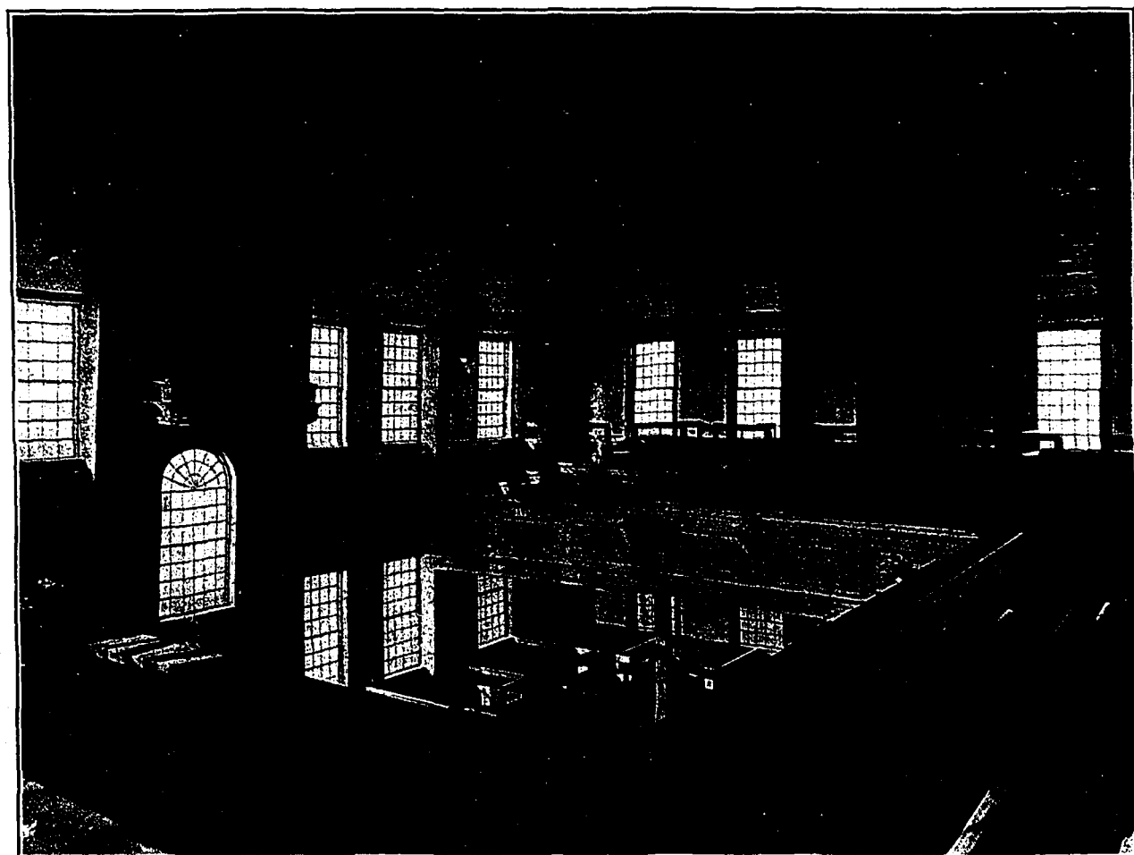
Old Church at Rockingham, Vermont. (Begun 1787.) Interior.