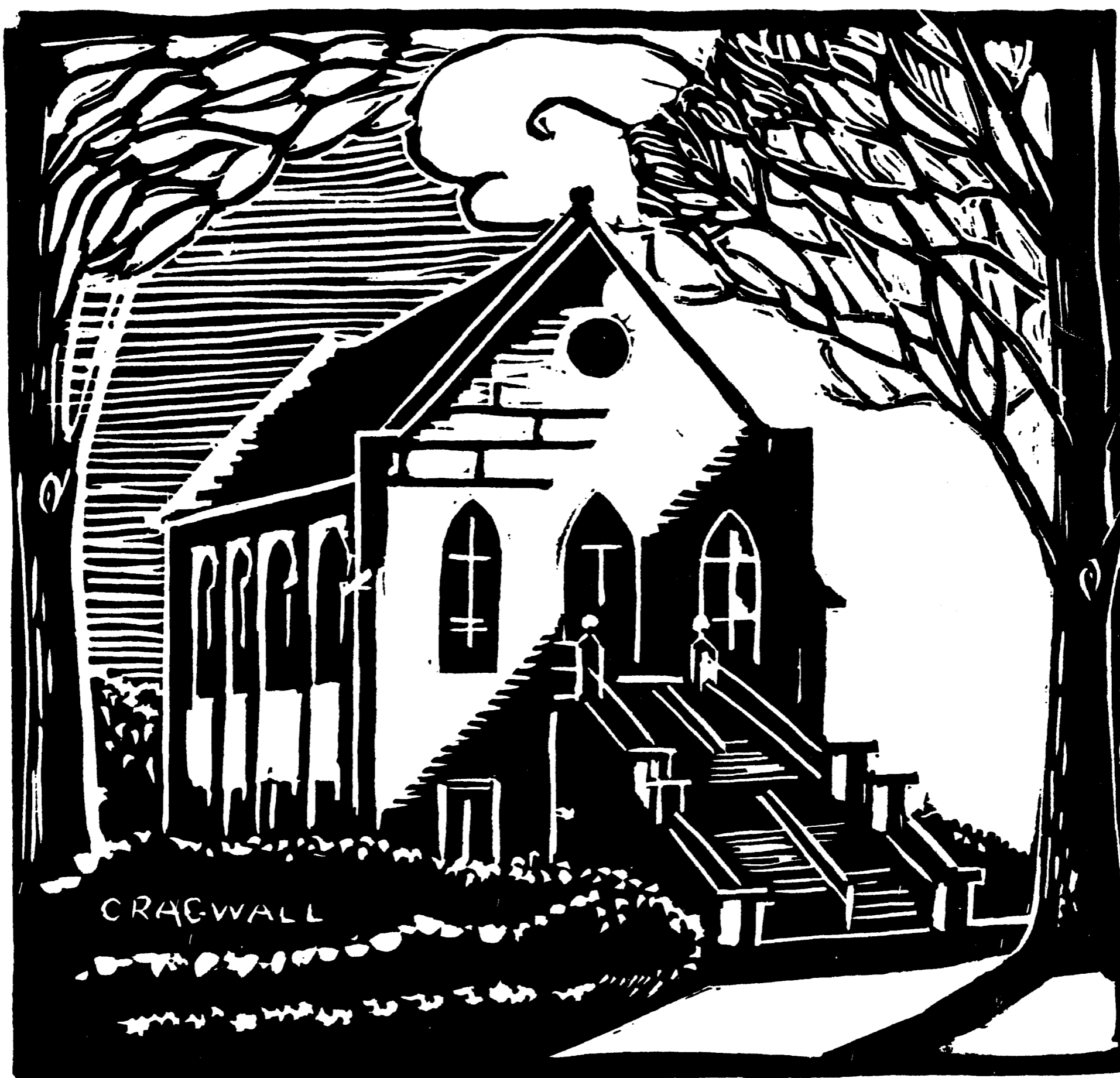
OLD TEMPLE BETH ISRAEL, JACKSON