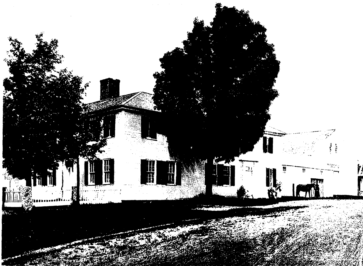
HOMESTEAD, NEWFIELD, MAINE.