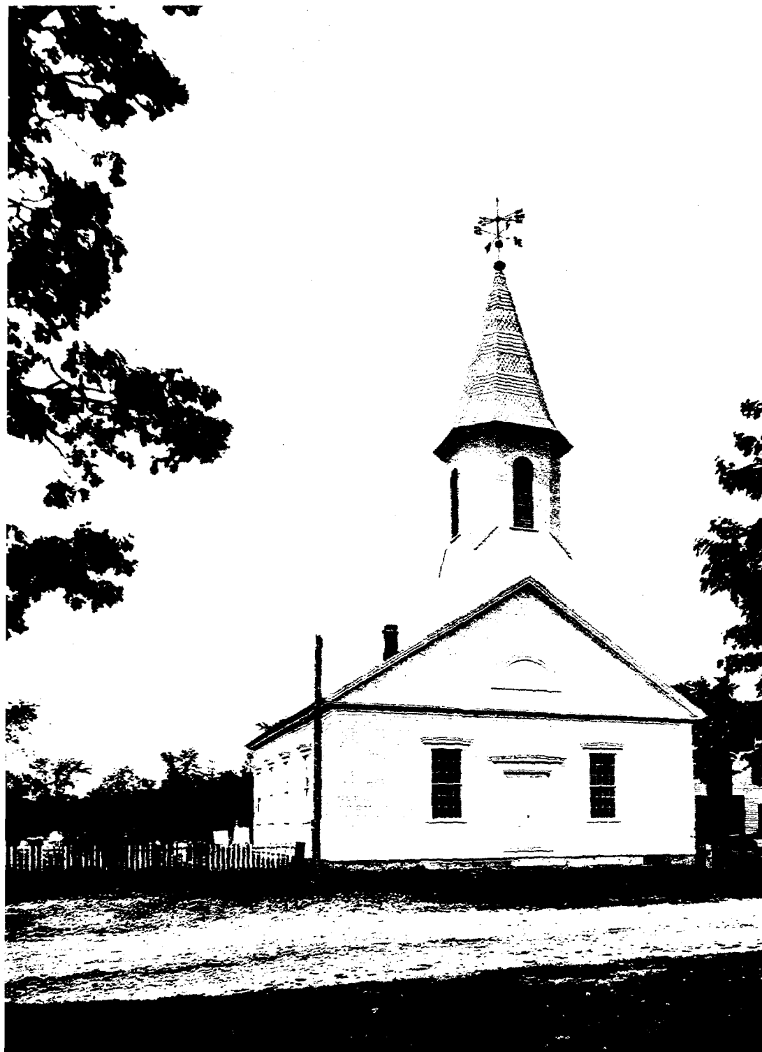
MEETING-HOUSE AND BURIAL-GROUND, NEWFIELD, MAINE.