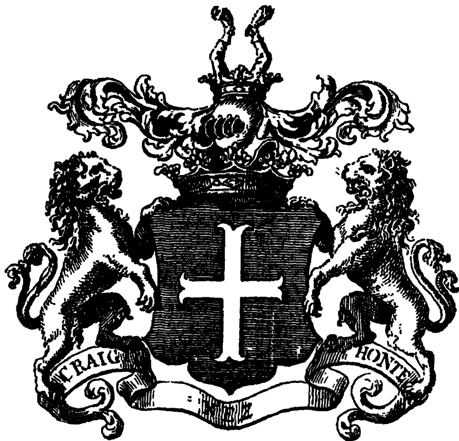
Bentinck Duke of Portland