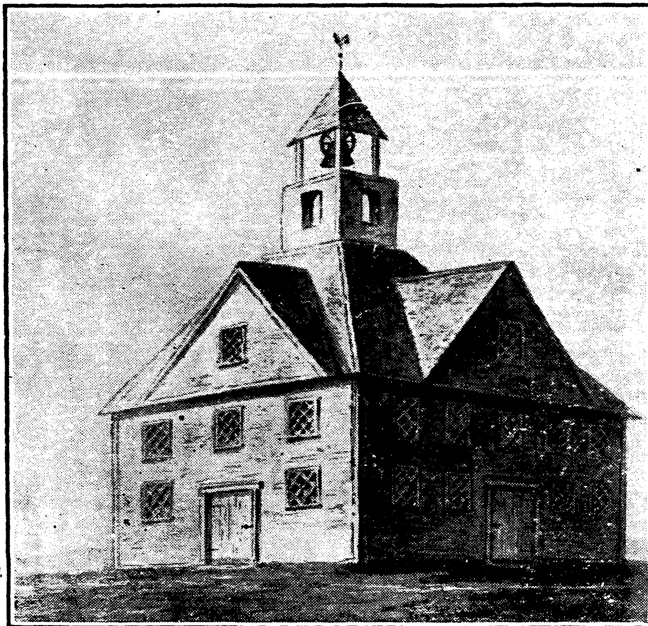
First Church (Congregational) at Beverly Mass. 1667-1772