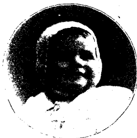
A MELLINS FOOD BABY.