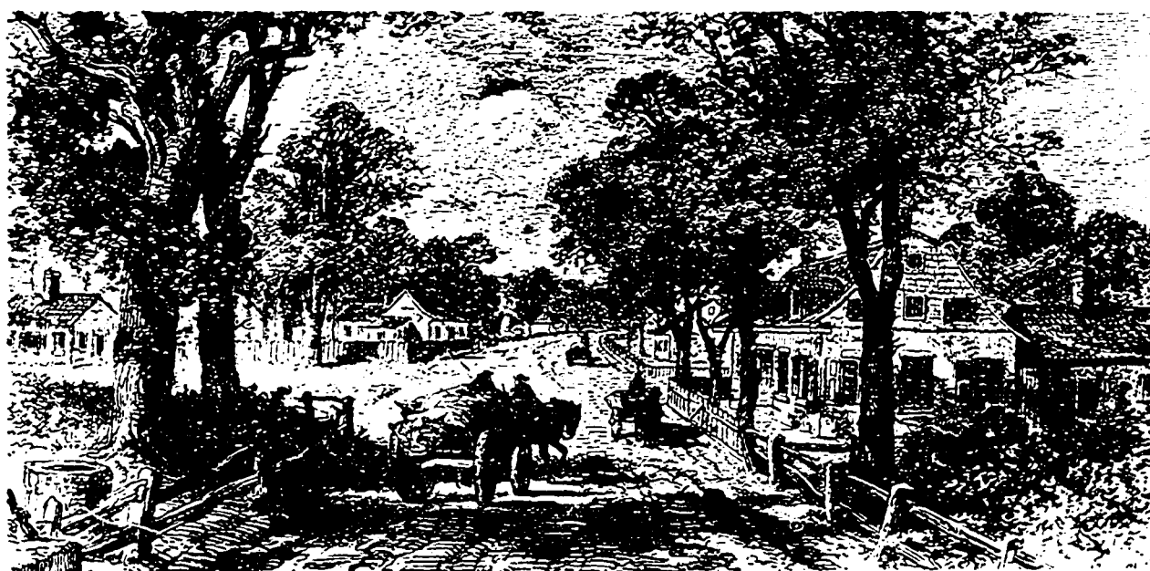
Early Brooklyn Farms